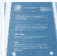
"Home of Dixie Boys Baseball" Marker Central Louisiana

The biggest news for the 2018 season will be the implementation of a new USA Baseball bat standard (USABat). Dixie Boys Baseball looks forward to providing youth (age 13-19) the opportunity to play the great game of baseball.